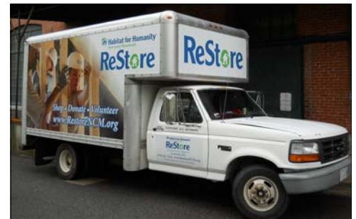
Our ReStore truck is ready for pick-ups & deliveries

The welcome mat is always out at our ReStore. You never know what you'll find because the stock changes often..